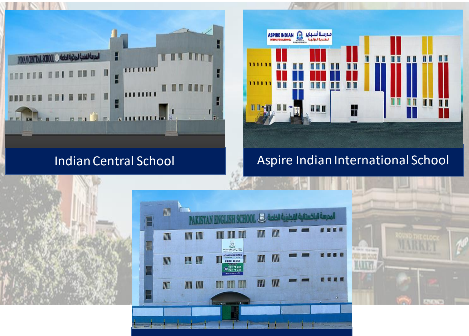
Pakistan English School

Dar Al Salam is a private company operating in the education industry offering a multitude of curricula for K-12 students. Indian Central School, Pakistan English School and Aspire Indian International School are all part of Dar Al Salam Schools. Collectively, our schools offer the CBSE, FBISE, Cambridge and IGSCE curriculums boasting a combined student strength of over 8000 – proudly making us one of the largest school groups with a multitude of nationalities in our community. Over nearly two decades, we have cultivated a legacy of consistent performance across our growing school portfolio continuing to leverage digital infrastructure, managing effective teams and developing innovative operations.